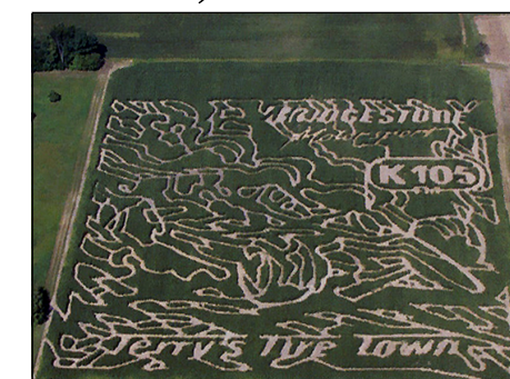
Maize Valley Farms- Corn Maze

To reserve your tickets- call The Arc at 330-492-5225 or email Kathleen at kfockler@arcstark.org. Tickets must be reserved by September 8, 2008.